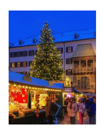
Day 1: Travel Day

7 Days • 8 Meals: 5 Breakfasts • 3 Dinners